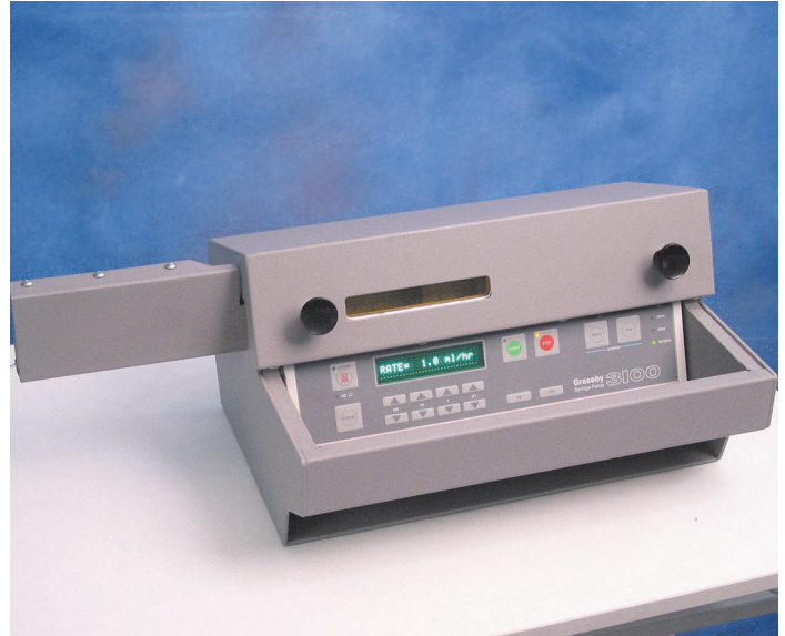
Lead glass window offers 6.2 density with clear visibility of syringe.

The Injection Pump Shield protects technologists from harmful body exposure during the injection of radionuclides requiring a very slow infusion protocol. Featuring 0.50"-thick lead, the shield accommodates Graseby Syringe Pump models 3100 and 3400. To use the Injection Pump Shield, simply open the shield cover, insert the syringe from behind the shield, connect the I.V. tubing, and then close the cover. A lead glass viewing window allows the technologist to ensure the dose is being properly administered throughout the entire procedure. The cover can slide lengthwise to reveal the syringe stopcock for adjustments without exposing the syringe.